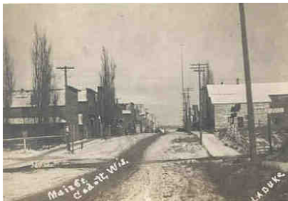
Main Street Cadott—Winter 1908

The Talent, Technology and Target Industry Assessment, which included a larger 9-county area, was coordinated by Momentum Chippewa Valley. A final report will be published and available at the end of January 2008 and a leadership committee to work on regional recommendations will be formed.