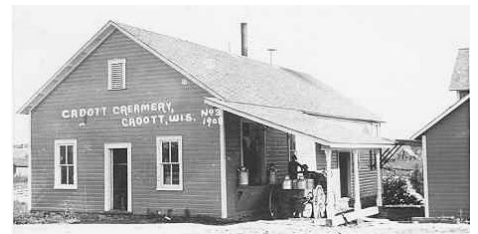
Cadott Creamery—Circa 1900